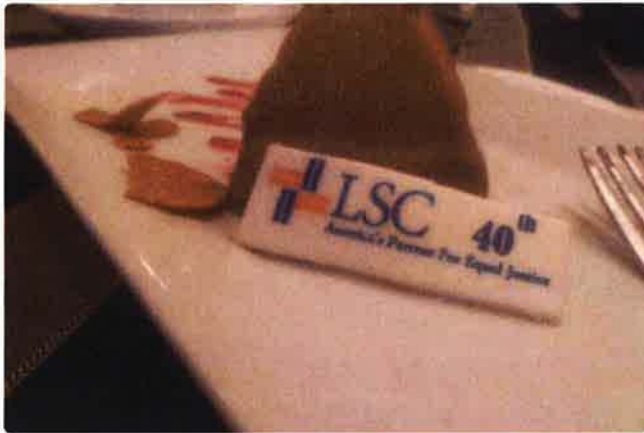
Celebrating 40 Years of the Legal Services Corporation