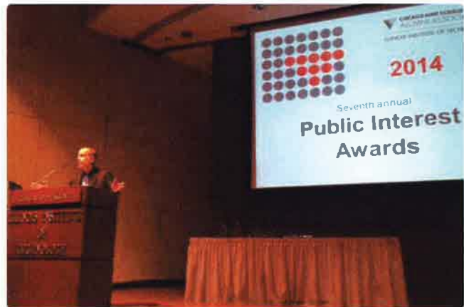
Public Interest Awards Night 2014