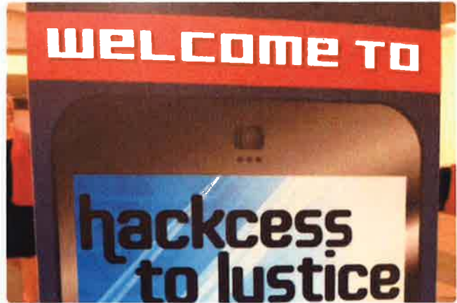
ABA Journal Access to Justice Hackathon 2014