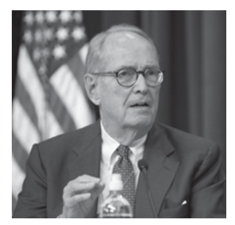
The Honorable Dick Thornburgh, former U.S. Attorney General and former Governor of Pennsylvania

To improve evaluation of pro bono activities by LSC-funded organizations, the Task Force recommends that LSC: