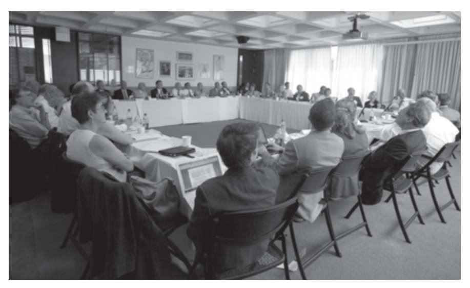
Members of the Pro Bono Task Force at their inaugural meeting

In 2009, the Indiana Supreme Court announced a campaign to train more than 700 Indiana judges, mediators, and lawyers on handling foreclosure cases. The Court offered scholarships to private attorneys for the training if they agreed to handle one mortgage foreclosure case on a pro bono basis.